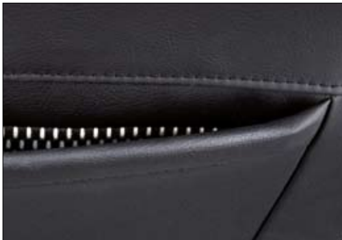
Detail map pocket

ISRINGHAUSEN, Inc. 1458 South 35th Street Galesburg, Michigan 49053 USA Phone (001) 2694845333, Fax (001) 2694845344 www.isriusa.com