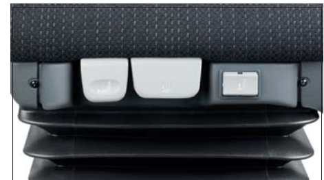
Seat controls (KM)