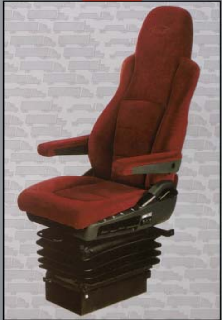
MODEL 6800 PREMIUM SEAT

Available in fabric or leather in a variety of Peterbilt colors.